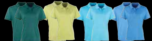
Bottle Lime Turquoise Sapphire