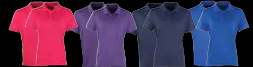
Hot pink Purple Navy Royal