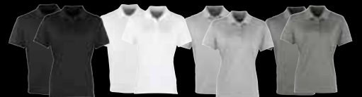
Black White Silver Dark grey