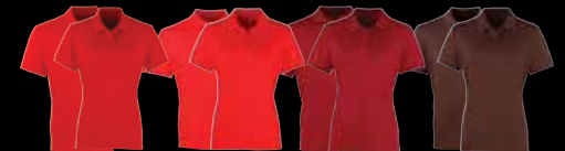
Red Strawberry red Burgundy Brown